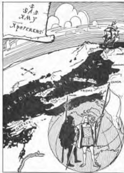
The cipher signature of Columbus, (reproduced above) is generally interpreted Salve Christus, Meria, Yosephus-Christoferens. It was usual in build personal ciphers upon date. If the seven large letters above the signature are read according to the medieval system of numeration the date 1420 results. The "x" appears to be a double letter composed of "ix"; this would increase the sum to 1430. Is this then the true and unknown birthdate of the Greek navigator?